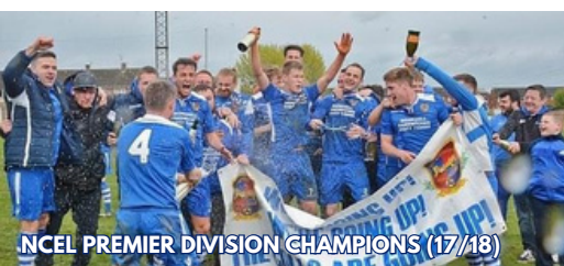
NCEL PREMIER DIVISION CHAMPIONS (17/18)