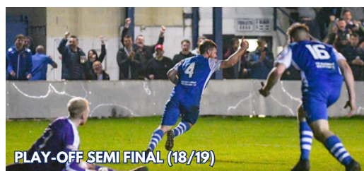
PLAY-OFF SEMI FINAL (18/19)