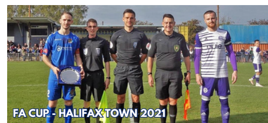
FA CUP - HALIFAX TOWN 2021