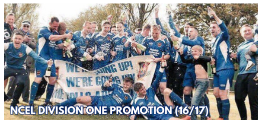
NCEL DIVISION ONE PROMOTION (16/17)