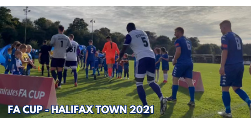
FA CUP - HALIFAX TOWN 2021