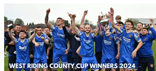
WEST RIDING COUNTY CUP WINNERS 2024