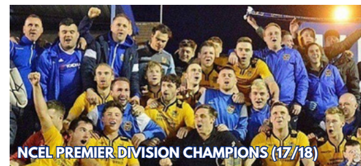
NCEL PREMIER DIVISION CHAMPIONS (17/18)