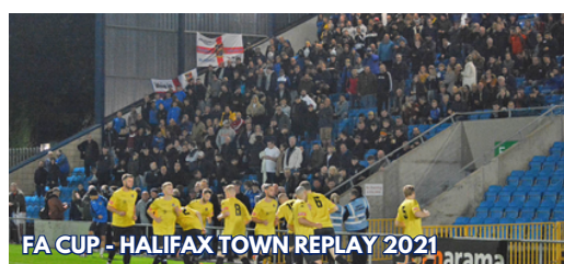
FA CUP - HALIFAX TOWN REPLAY 2021