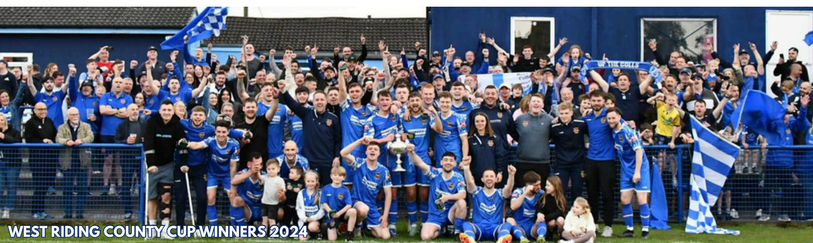
WEST RIDING COUNTY CUP WINNERS 2024